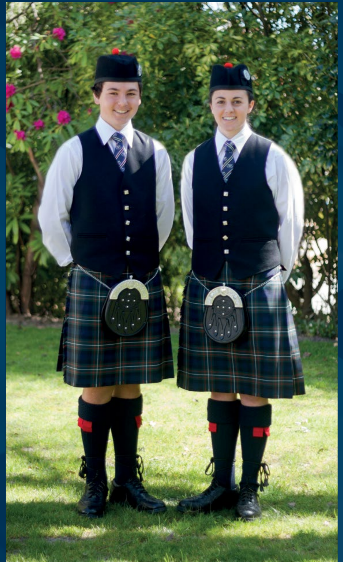
Use this photo as a guide to correct presentation of the St Andrew's College Pipe Band uniform.

St Andrew's College has a zero tolerance policy on drug use. Drugs are illegal and the College retains a non-negotiable position on any illegal substances.